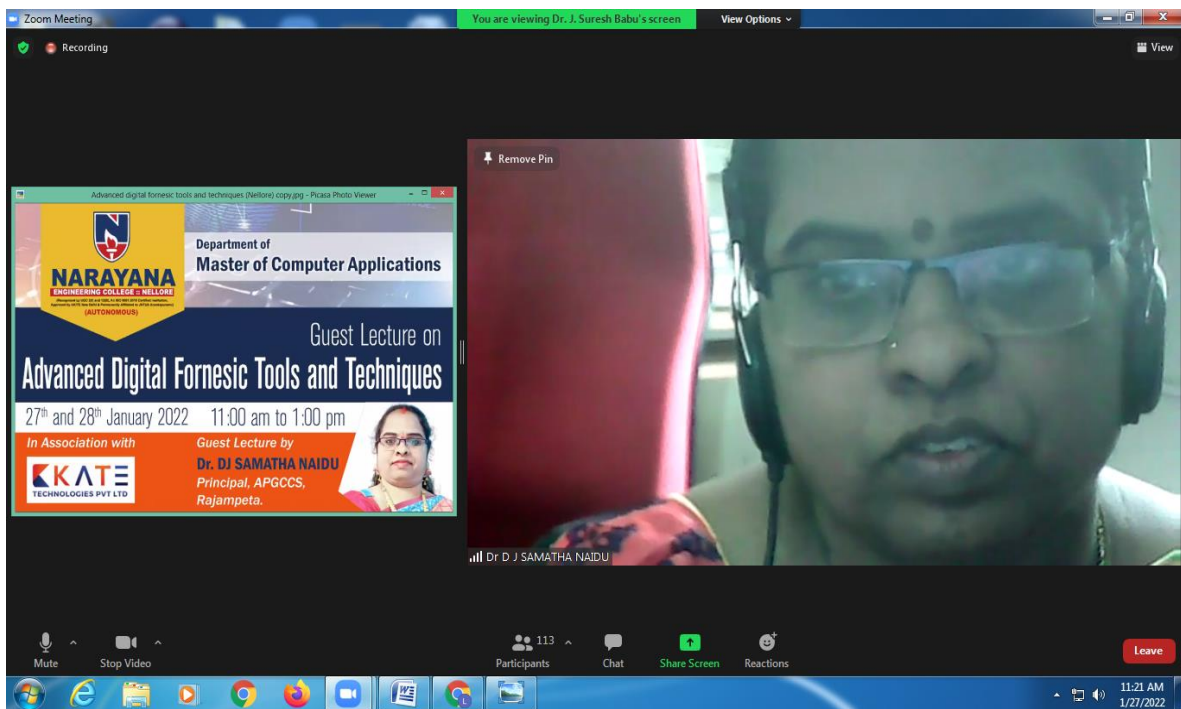
Resource person interacting to the Students